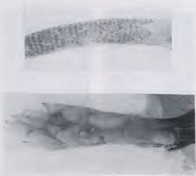
Figure 2 Plate of the tail and of the pes plantar surface of Melomys cooperae sp. nov., holotype.